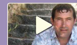
THE EDWIN DAVIS MEMORIAL CIC

Please donate to the Edwin Davis Memorial CIC at www.showupnow.co.uk